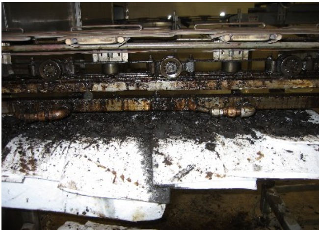
Carbon Debris Removed before converting to HT-2000™ by using CC-2208 Carbon Clean

Carbon Clean is a lubricant cleaner used to help soften and dissolve carbon build up on all roller ball bearing chains, pin/roller chains, tortilla chains, slides and gears that require cleaning. If converting from graphite to synthetic lubricant, carbon clean can be used to soften graphite carbon build on chains.